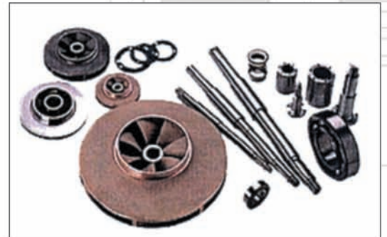
20% of spares are responsible for 80% cost