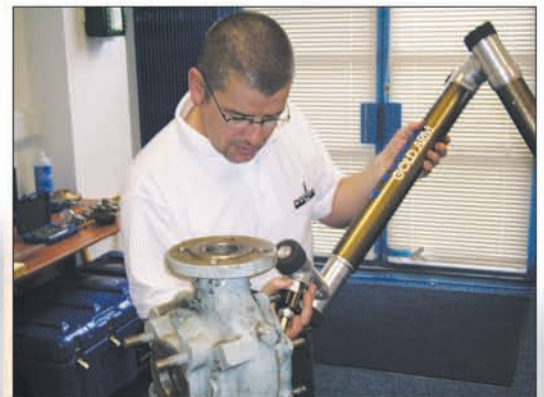
Experts collect geometric data