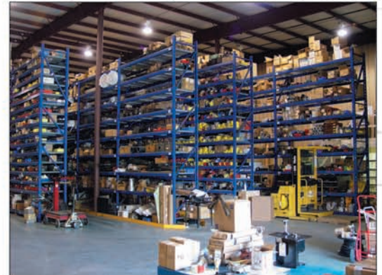
Extensive spares stores lock up capital

We would be delighted to make an appointment and demonstrate how we propose to lift the hidden treasure in your spare stores.